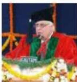
93 th Convocation – 2011 Hon'ble Minister of HRD Shri Kapil Sibal