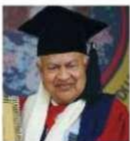
96 th Convocation – 2014 Padma Vibhushan Prof. Jayant Vishnu Narlikar