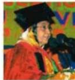
91 th Convocation – 2009 Hon'ble President of India Smt. Pratibha Devi Singh Patil