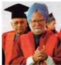
90 th Convocation – 2008 Hon'ble Prime Minister of India Dr. Manmohan Singh