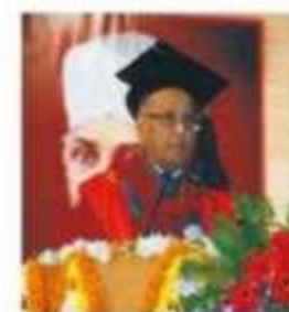
Special Convocation – 2012 Hon'ble President of India Shri Pranab Mukherjee