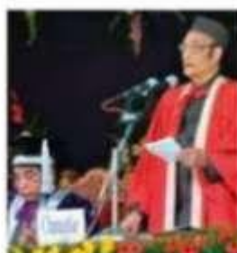
95 th Convocation – 2013 Hon'ble Chancellor of BHU Dr. Karan Singh