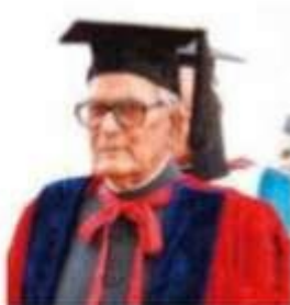
89 th Convocation – 2007 Hon'ble Vice-President of India Shri Bhairon Singh Shekhawat