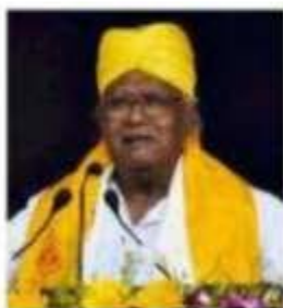
99 th Convocation – 2017 Bharat Ratna Prof. C.N.R. Rao, FRS