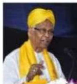
100 th Convocation – 2018 Padma Vibhushan Dr. Raghunath Anant Mashelkar, FRS