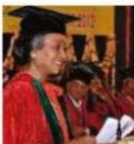
94 th Convocation – 2012 Hon'ble Speaker of Lok Sabha Smt. Meira Kumar