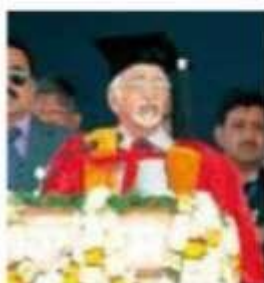
92 th Convocation – 2010 Hon'ble Vice-President of India Shri Hamid Ansari