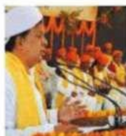
97 th Convocation – 2015 Padma Vibhushan Dr. G. Madhavan Nair