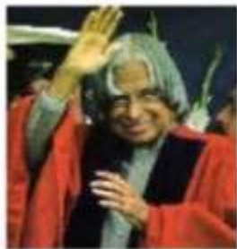
88 th Convocation – 2006 Hon'ble President of India Dr. APJ Abdul Kalam