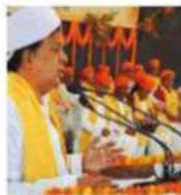
97 th Convocation – 2015 Padma Vibhushan Dr. G. Madhavan Nair