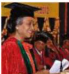
94 th Convocation – 2012 Hon'ble Speaker of Lok Sabha Smt. Meira Kumar