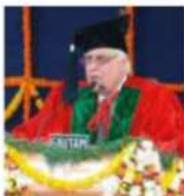
93 th Convocation – 2011 Hon'ble Minister of HRD Shri Kapil Sibal