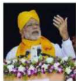
98 th Convocation – 2016 Hon'ble Prime Minister of India Shri Narendra Damodar Das Modi