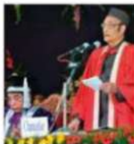
95 th Convocation – 2013 Hon'ble Chancellor of BHU Dr. Karan Singh