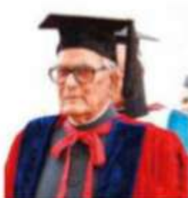
89 th Convocation – 2007 Hon'ble Vice-President of India Shri Bhairon Singh Shekhawat