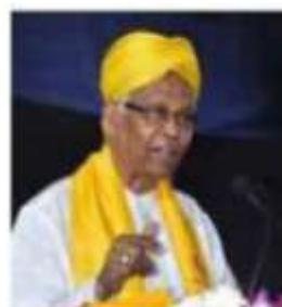
100 th Convocation – 2018 Padma Vibhushan Dr. Raghunath Anant Mashelkar, FRS