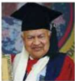
96 th Convocation – 2014 Padma Vibhushan Prof. Jayant Vishnu Narlikar