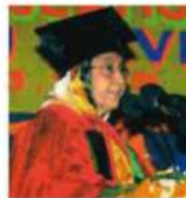
91 th Convocation – 2009 Hon'ble President of India Smt. Pratibha Devi Singh Patil