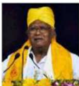
99 th Convocation – 2017 Bharat Ratna Prof. C.N.R. Rao, FRS