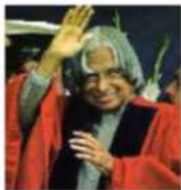
88 th Convocation – 2006 Hon'ble President of India Dr. APJ Abdul Kalam