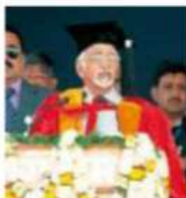
92 th Convocation – 2010 Hon'ble Vice-President of India Shri Hamid Ansari