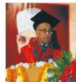
Special Convocation – 2012 Hon'ble President of India Shri Pranab Mukherjee