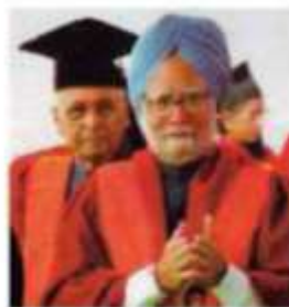
90 th Convocation – 2008 Hon'ble Prime Minister of India Dr. Manmohan Singh